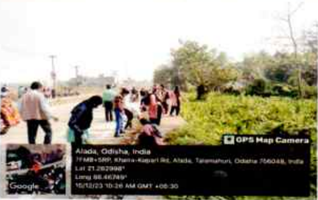
GPS Map Camera

Talamahuri, Odisha, India Rupari - Bero Rd, Talamahuri, Odisha 756048, India Lat 21.28310° Long 86.40781° 15/12/23 10:28 AM GMT +05:30