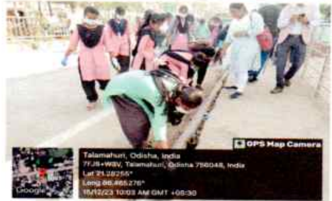
GPS Map Camera

Alada, Odisha, India 7F4M8+5M9, Khaira-Rupari Rd, Alada, Talamahuri, Odisha 756048, India Lat 21.282990° Long 86.46789° 15/12/23 10:28 AM GMT +05:30